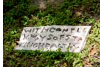
pollen, plaster, clay, ground