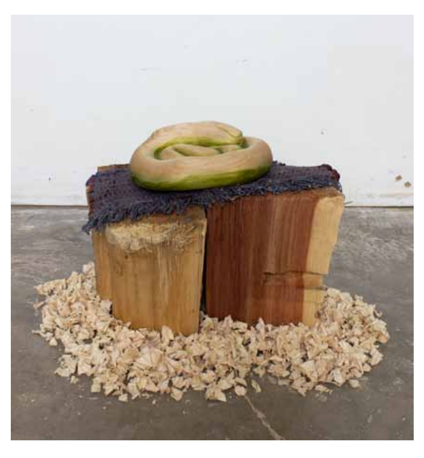
Charmed 2024 maple, dye, rug, purple heart, cedar, pine shavings 34×20×5 inches