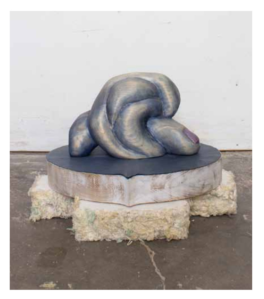
Fog 2024 maple, dye, leather, ash, plaster, cotton 11×17×12 inches