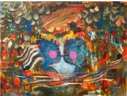
The Green Belt, 2023 vinyl paint on linen 18 x 24 inches —4,400