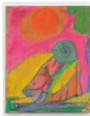
Hard Work, 2021 oil on linen 20 x 16 inches —7,500