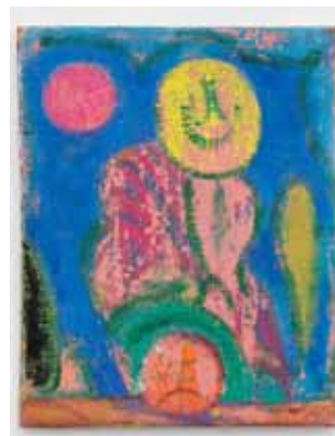
Halftime, 2021 oil on linen 20 x 16 inches —7,500