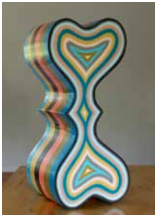
The Soft Parts sculpture, (interior), April 2025 baltic birch and Nova Color acrylic paint 26¾H x 12W x 12D inches —5,200