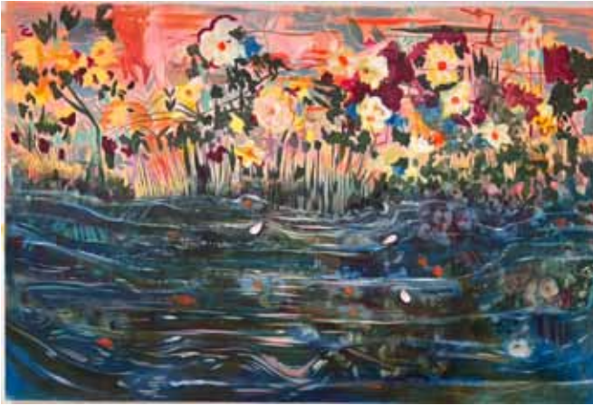
Kommel, 2025 vinyl paint on linen 48 x 72 inches —13,200