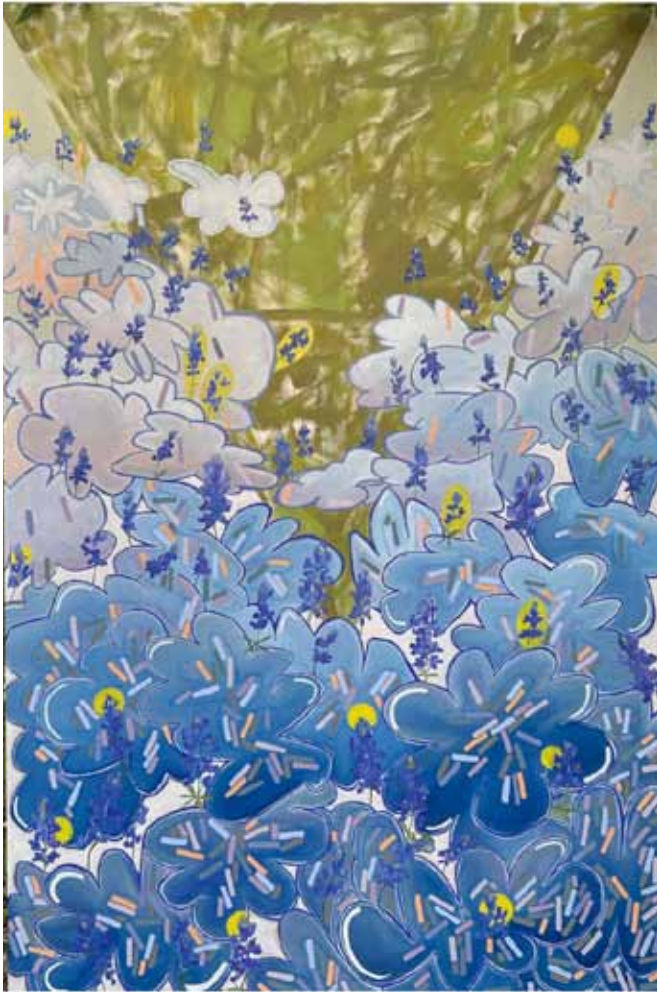
The Field that you are standing before, 2025 oil on canvas 65 x 43 inches —9,500