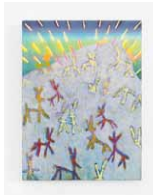
Point of Rocks, 2025 Oil on canvas 16 x 12 inches —1550