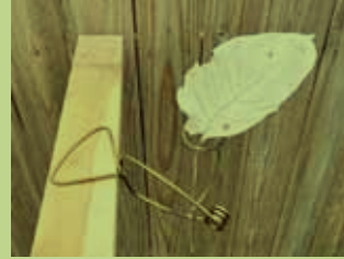
There seen from here, 2023 paper clay, brass 16 x 10 x 12 inches —1300

The handholds are the ceramic space left by Rachael Starbuck's grip.