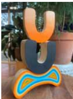
Squishy Sculpture, February 2025, oil and wax on oil paper applied to baltic birch 13.5H x 9.75W x 2.25D inches, —2400