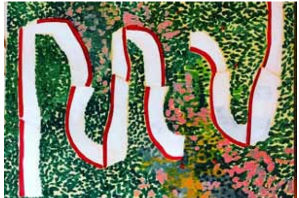
Spring, 2020 latex and vinyl paint on canvas 36 x 48 inches —8,500