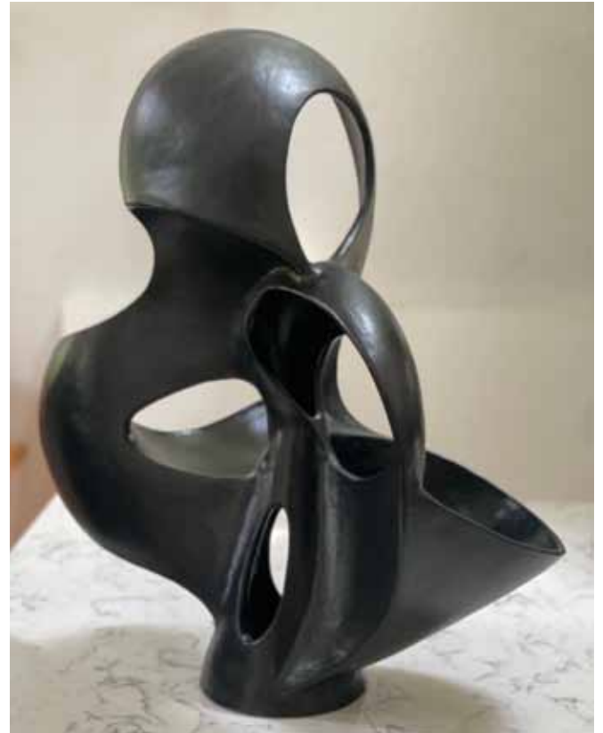
Venus of Vessels, 2025 glazed stoneware 23H x 21W x 12D inches —3,600

Encrusting Oysters on Clam bronze cast 60mm x 35mm —400