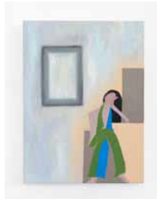
Window Seat, 2025 oil on canvas 16 x 12 inches —1550