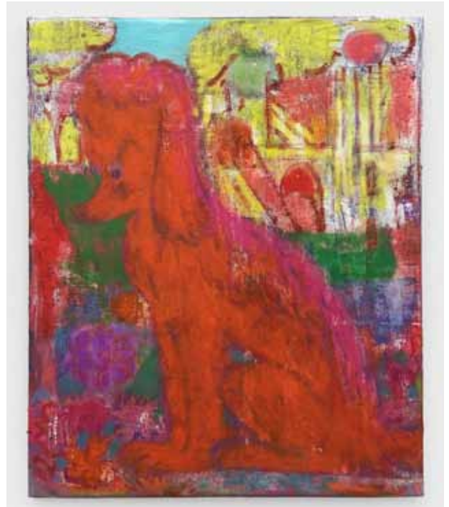
Tulip, 2021 oil on linen 36 x 20 inches —14,000