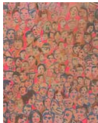
Hollywood, 2025 vinyl paint on Masonite 10 x 8 inches — 1,200