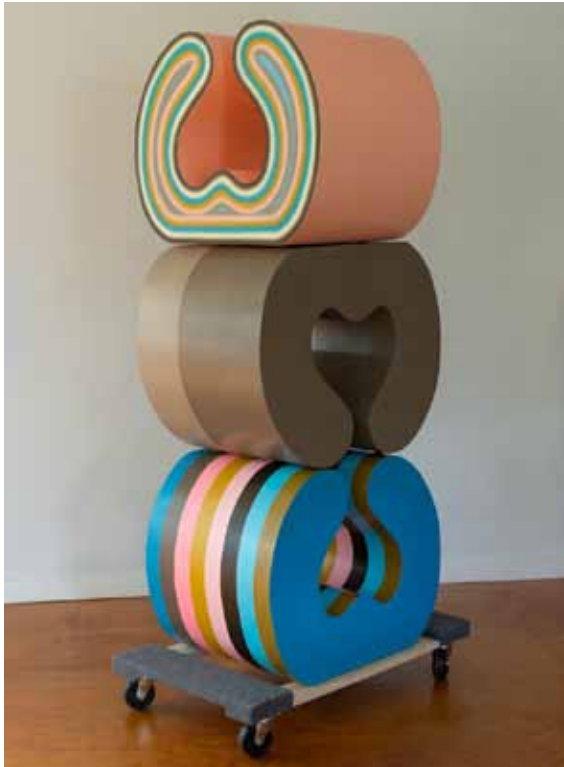
The Soft Parts sculpture (peach), May 2025 baltic birch and Nova Color acrylic paint 61H x 24W x 24D inches —18,000