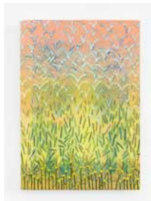
Everything might Happen, 2025 oil on canvas 14 x 10 inches —1120