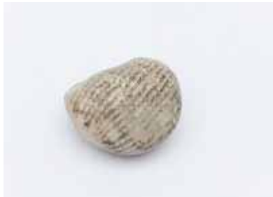
handhold (04), 2022 pit fired ceramic, wax, cork —500