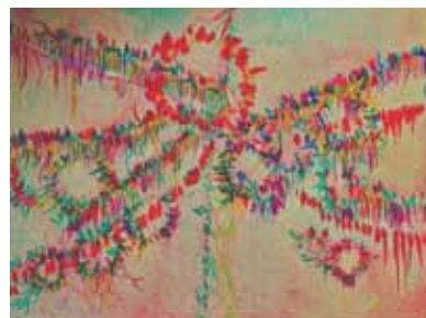
May 1, 2025 vinyl paint on Masonite 8 x 10 inches — 1,200