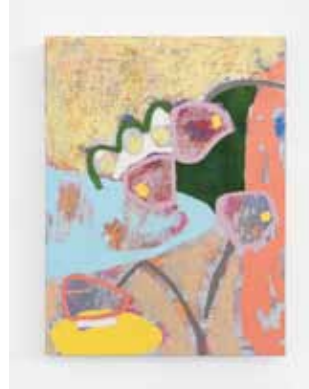
Jupiter Flower, 2025 Oil on canvas 16 x 12 inches —1550