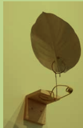
The light that gets consumed, 2023 paper clay, brass 18 x 10 x 7 inches —1300

The leaves are casts of portho plants grown by Rachael from cuttings made from her childhood home. Nomadic, they use clamps to root.