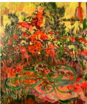
Post, 2023 vinyl paint and colored pencil on Masonite 10 x 8 inches — 2,800